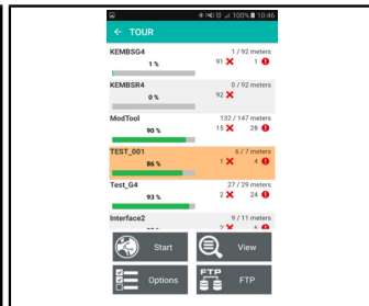
Tour list view